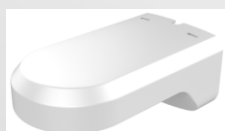
DS-2CD1294ZJ Wall mount